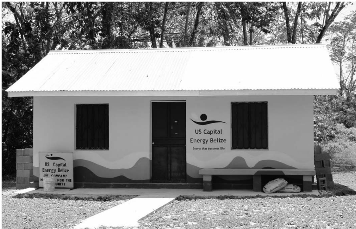
A HEALTH CENTRE BUILT BY US CAPITAL IN MIDWAY.